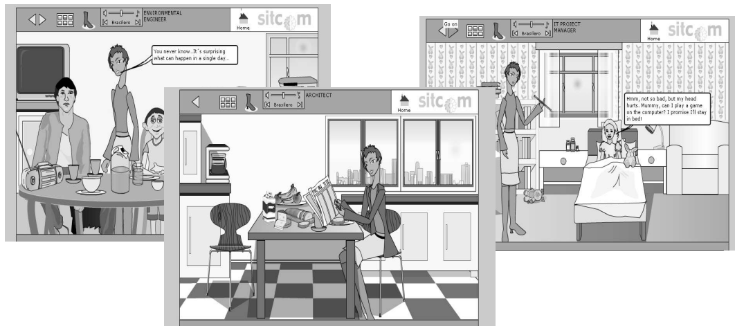
Figure 2: Private context; source: http://www.donau-uni.ac.at/sitcom

Professional context: The users get to know the woman in her professional setting