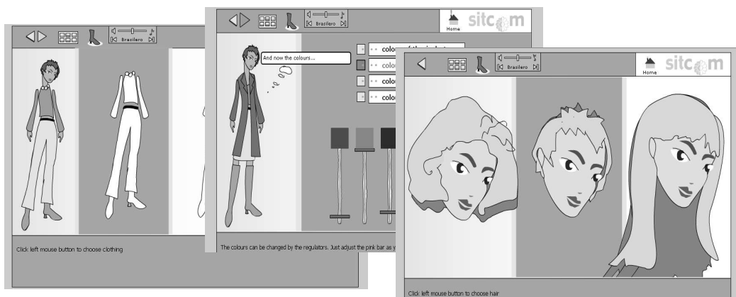
Figure 1: Personalization; source: http://www.donau-uni.ac.at/sitcom

In order to facilitate identification with the protagonist, the users are able to individually select names, hair styles, skin and hair colors, as well as dresses and colors of the dresses. Subsequently, the girls may choose a game related to the specific professions as mentioned above.