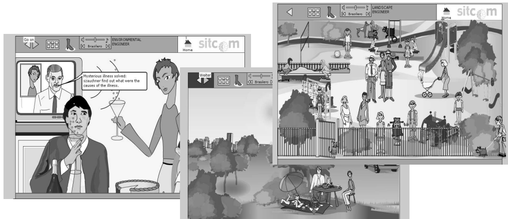
Figure 4: Implications

A final scene presents the work results or products of one's work, as well as possible implications for certain individuals or groups of people. This is another reference to the practical relevance of an occupation and its benefit for society.